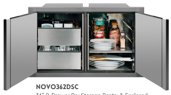
36" 2-Drawer Dry Storage Pantry & Enclosed Cabinet Combo