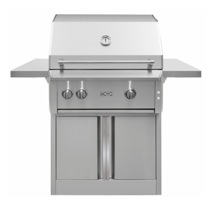
NOVO30 30" Gas Grill with Infrared Backburner with optional grill base