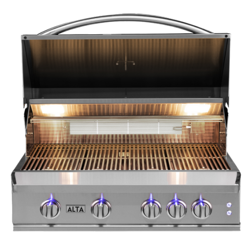
ALTA32 32" Gas Grill with Infrared Backburner

ALTA series grills incorporate the best of what we've learned from building high quality outdoor cooking systems into a well designed and affordable grilling machine.