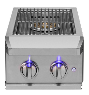
ALTADBLSB Double Side Burner