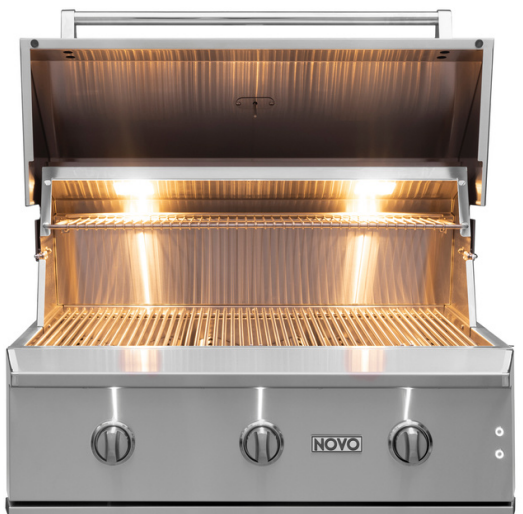
HONE36 36" Gas Grill

HONE series is our high-performance premium grill line. Crafted from the highest quality stainless steel & featuring our most powerful burners, HONE series grills are designed to elevate your backyard entertaining experience.