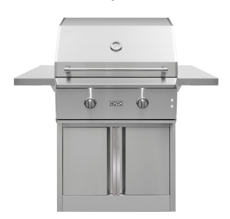
HONE30 30" Gas Grill with optional grill base