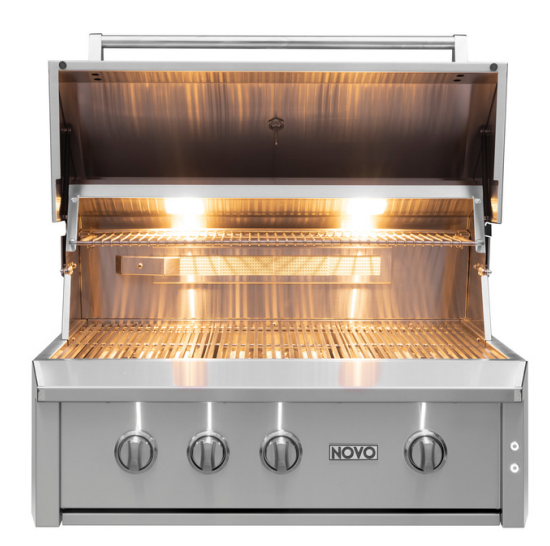
NOVO36 36" Gas Grill with Infrared Backburner

NOVO series grills are the culmination of decades of experience and innovation designing and building the very best outdoor cooking systems. Crafted from the highest quality stainless steel and featuring our most powerful burners and professional grade features, our luxurious NOVO grills are designed to be the centerpiece of your backyard.