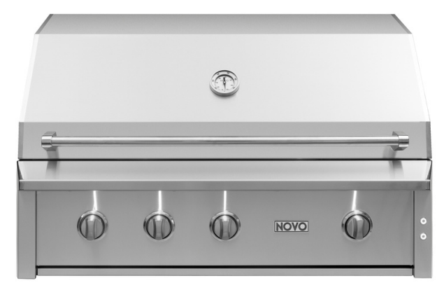
NOVO42 42" Gas Grill with Infrared Backburner