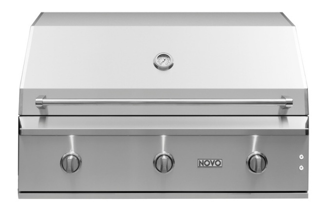
HONE42 42" Gas Grill