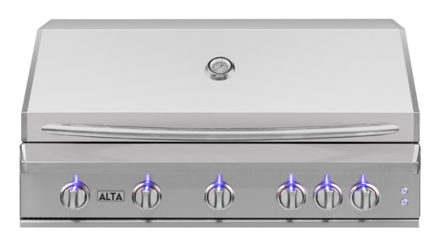
ALTA40 40" Gas Grill with Infrared Backburner