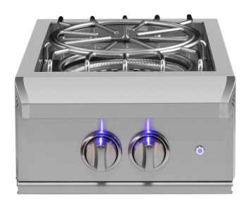
ALTAPB Power Burner